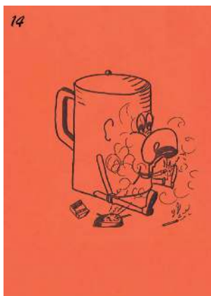
Saturated again with carbon dioxide