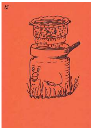
Filtered and brought to the temperature of 105 °C