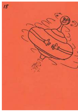
Sugar granules are separated from "molasses" water through two centrifugation phases...