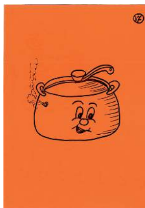
Vacuum concentrated until sugar granules form