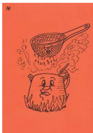
Filtered again, part of the water evaporates